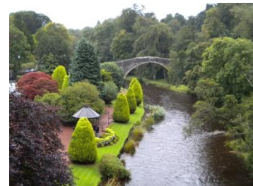
Brig o’ Doon

The post code for your Sat Nav is KA7 4PQ