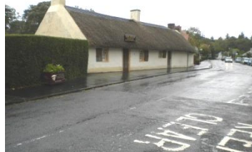
Burns Cottage Now