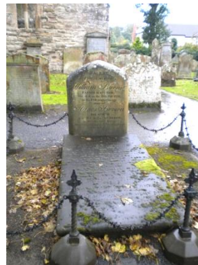
Burns father’s grave, Kirk Alloway